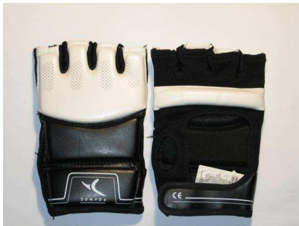
GLOVES (FROM 14 TO 17 YEARS OLD)

Another type of protections will be allowed if they offer the same level of protection.