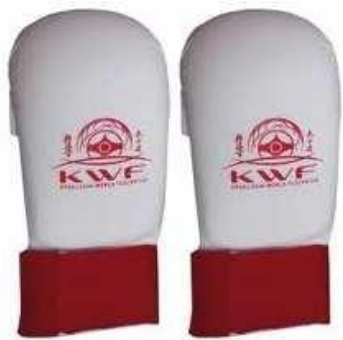
GLOVES (FROM 12 TO 13 YEARS)