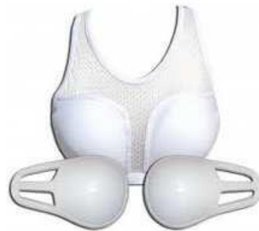
CHEST PROTECTOR FOR GIRLS